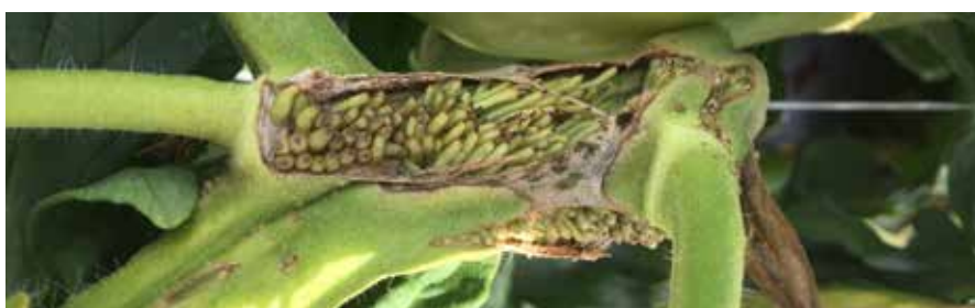
Right: Pith necrosis on tomato caused by multiple species of the bacterium, Pseudomonas and Pectobacterium carotovorum . Dark discoloration of the stem pith and development of adventitious roots are common symptoms of pith necrosis.