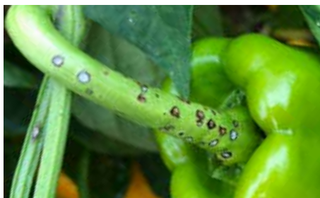
Left: Frog-eye leaf spot on pepper caused by fungus Cercospora capsici .