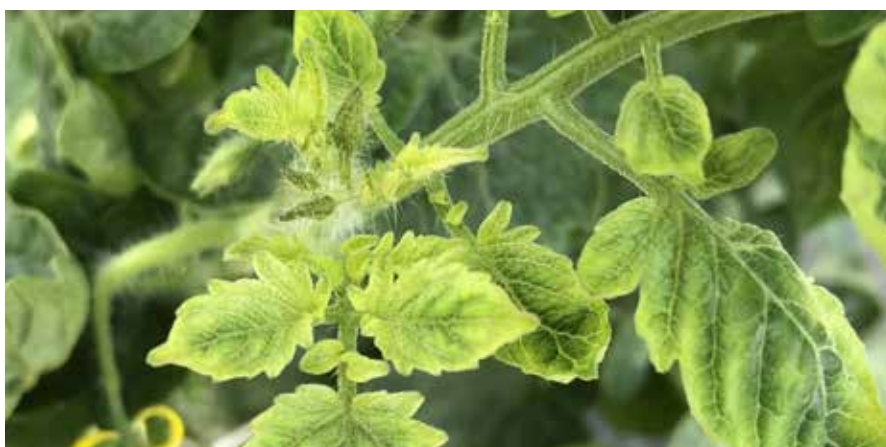
Bottom: Symptoms of Tomato Yellow Leaf Curl virus (TYLCV) on tomato.