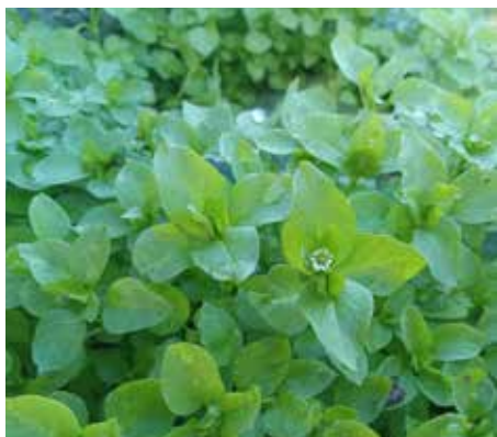
Left: Stellaria media , Common chickweed, is a cool-season annual flowering plant that is naturalized throughout the world.